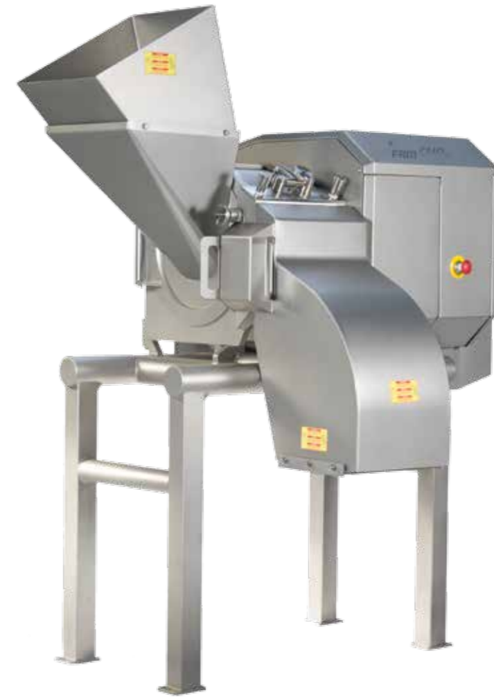
High Capacity Dicer for Meat & Cheese