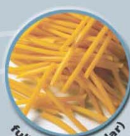
full shred (cheddar)